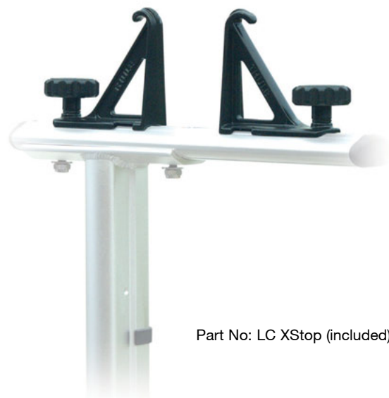
Part No: LC XStop (included)

LC 421 No Fit No Fit LC 421 LC 422 No Fit No Fit No Fit LC 421 LC 421 LC 421 LC 421 LC 421 LC 421 LC 421 LC 421